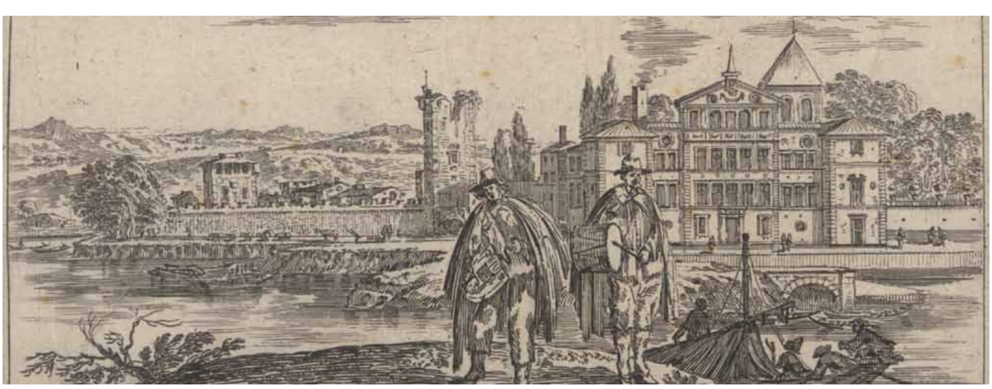
House of Vimy near Lyon, residence of the de Neuville de Villeroy family, today known as Neuville sur Saône, engraving, Israël Silvestre, 17th c., Inv. 46.434