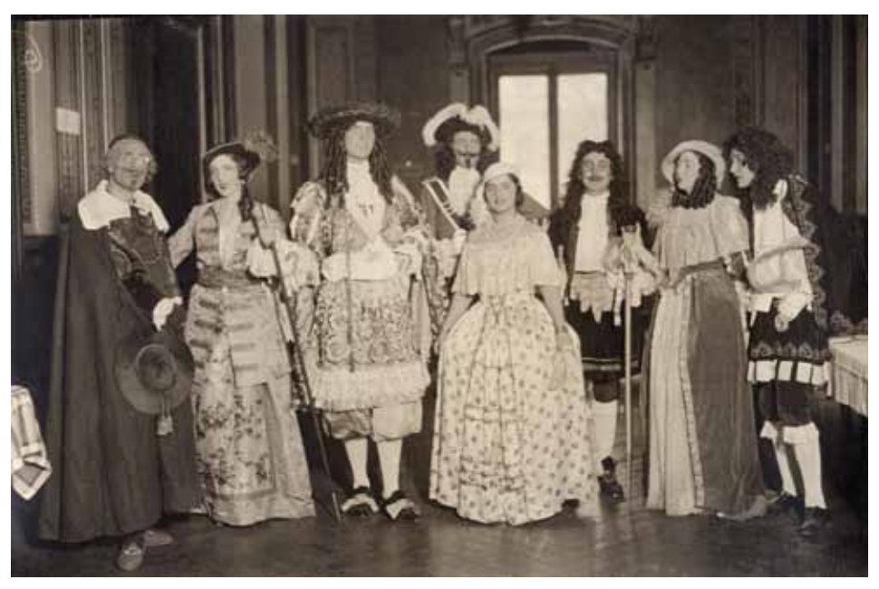
Louis XIV and Mazarin place Bellecour in 1659, photograph of the recreation of the théâtre des Célestins, 8 to 11 February 1932, Inv. N 2186.1

The town council continued to pay deference to the king, paying homage to him in the hotel where he was staying at place Bellecour. It was here that a statue of the king on horseback was erected in 1713.