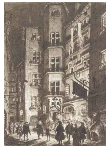
Fanciful view of Gadagne House in a Renaissance fête in the street created in 1650, etching, Jean-Baptiste (known as Joannes) Drevet, 1901, Inv. (9) 96.32

It was during this same period of enthusiastic building, at the start of the second half of the 17 th c., that he undertook this gallery and lavishly adorned it with a painted ceiling. A number of documents, particularly estimates, exist as proof of this work, except between 1656 and 1661, a period during which the notarial records are lacking: this suggests that the painted ceiling, for which no estimate has ever been found, dates from this period. In the late 17 th c., under the impetus of Falconet, the buildings of the current museum, as we know them today, were completed.